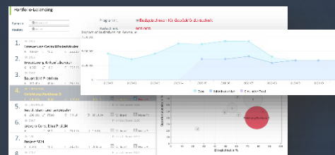
Portfolio-Balancing & Scenario Comparison